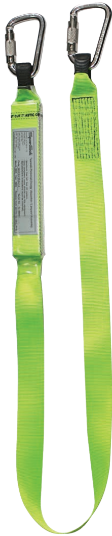
3053 WW K4